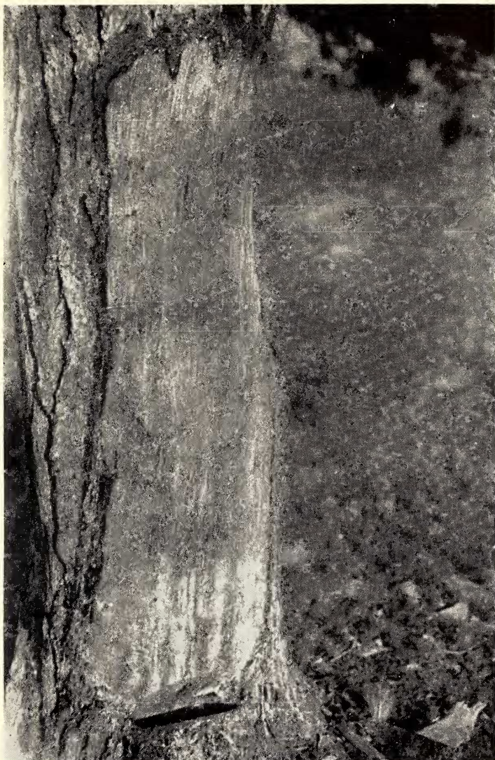
FIG. 4. Method of bleeding tree for gum (oleoresin). Note "cup" chopped in tree at base of peeled face.

many of the very scattered older stands, reproduction is lacking. There are indications in some areas that previously pine-covered land may degenerate to desert scrub if present treatment continues. Conversely the high mountain, virgin forests contain considerable overmature timber that is dying out. This could well be harvested if there were any method whereby the timber could be economically transported to markets.